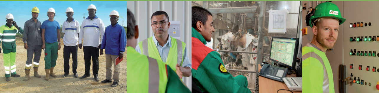
Our teams are at your service