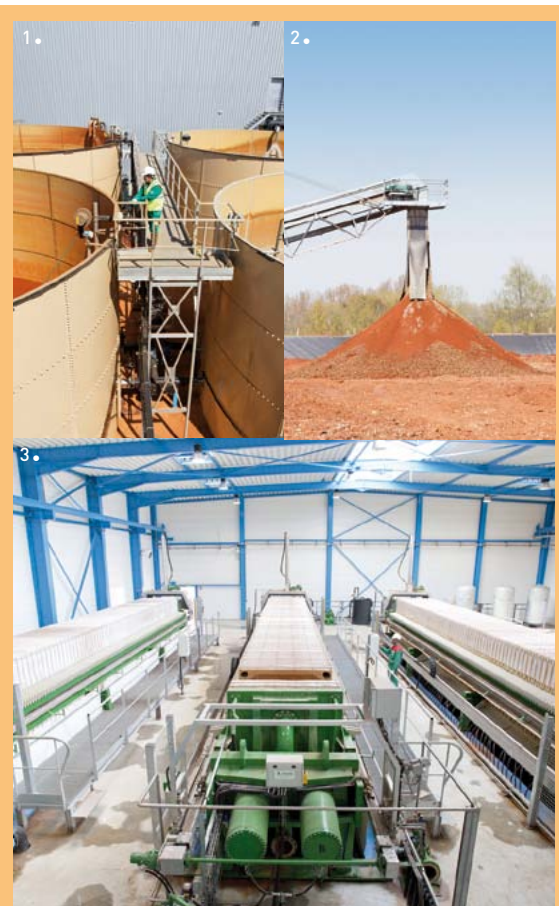
1, 2, 3. Processing industrial effluents and sludges